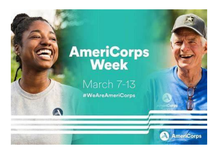
National AmeriCorps Week: March 7 – 13, 2023

This week provides the perfect opportunity for <a href="AmeriCorps">AmeriCorps</a> Members, alums, awardees, program partners, and friends to shine a spotlight on the work done by Members—and to motivate more Americans to serve their communities. Many events are scheduled across the country. Individuals and organizations with a special interest in AmeriCorps—especially, Members, programs, and alums—are encouraged to use their creativity to mark the week in any way they see fit. The choice is up to you BUT recognition must be a part of it!