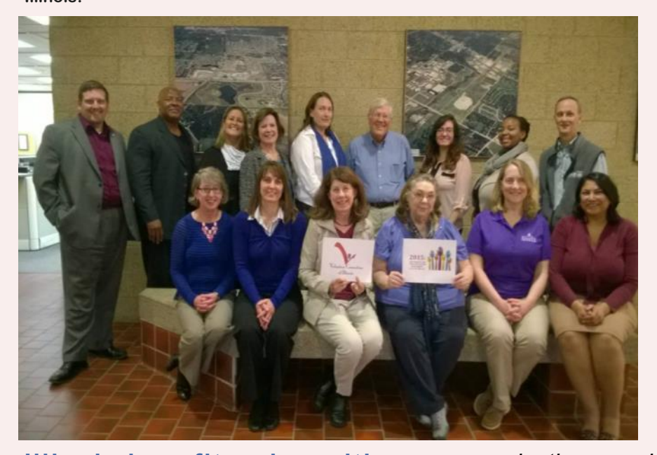
Illinois benefits when citizens , organizations, and businesses work together and strengthen their communities through volunteering and community service.

In 1979, the Commission was founded as the Illinois Office of Voluntary participation. The office changed names and was housed in several different offices before finding its place in the Department of Public Health in 2014. After the implementation of the Illinois Commission on Volunteerism and Community Service Act in 2000, the Commission was aptly named the Illinois Commission on Volunteerism and Community Service. The Commission began using the "Serve Illinois" moniker in 2007. The Serve Illinois Commission on Volunteerism and Community Service is currently housed within the Department of Public Health, Office of Preparedness and Response, located at 422 S. 5th Street in Springfield, Illinois.