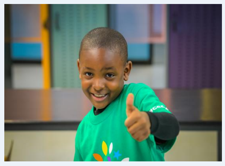
Thumbs Up for the Year of the Volunteer and the 2.5 million Illinoisans who give their time so generously!

2015: The Year of the Volunteer was Sponsored by Generations Serving Generations, the Serve Illinois Commission, the Illinois Department on Aging, the McCormick Foundation, the Illinois Senate and more than 100 education, aging, business and non-profits. Generations Serving Generations is a public/private partnership established in 1986 and selected by the National Governors Association effort on civic engagement in service, learning and work. Congratulations to the McCormick Foundation for HB4025 that will give high school students greater civic opportunities.